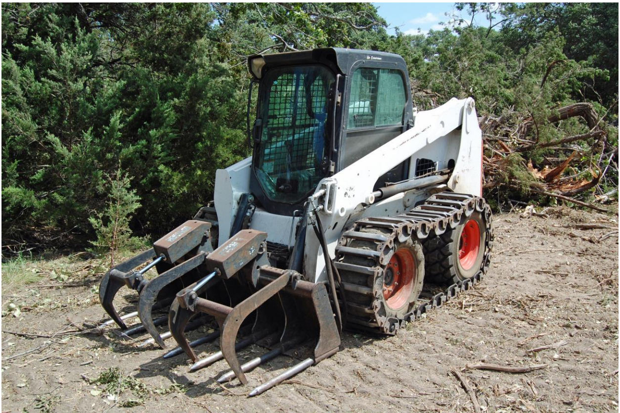
S630 Bobcat skid steer loader with foam-filled tires, steel tracks, and a tine-fork grapple http://www.bobcat.com/loaders/skid-steer-loaders/models/s630/features

Determining where and where not to thin is an important first step for any juniper thinning project. This determination drives the decision on which thinning method and type of equipment to use, such as mechanical vs biological control or bulldozer vs skid steer machinery. On the C.L. Browning Ranch, the shallow soils and steep slopes eliminated bulldozers as an appropriate option yet the density of juniper eliminated fire as a safe control method. For these reasons, skid-steer loaders and hand crews were selected as a responsible and effective way to thin the juniper. After testing all appropriate makes and models of skid steers and hydraulic tree shears, the 70 + horsepower Bobcat model and the 14" Dymax tree shear were determined to be most effective tools for project. The foam-filled tires and steel tracks significantly improved our stability and traction when operating on steep slopes.